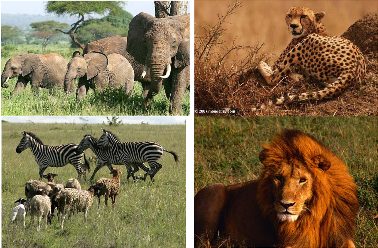
Fig.2. Four of the charismatic wildlife species found in the Serengeti ecosystem: From top left, elephant ( Loxodonta africana ), cheetah ( Acynonix jubatus ), zebra ( Equus burchelli ), and lion ( Panthera leo ).