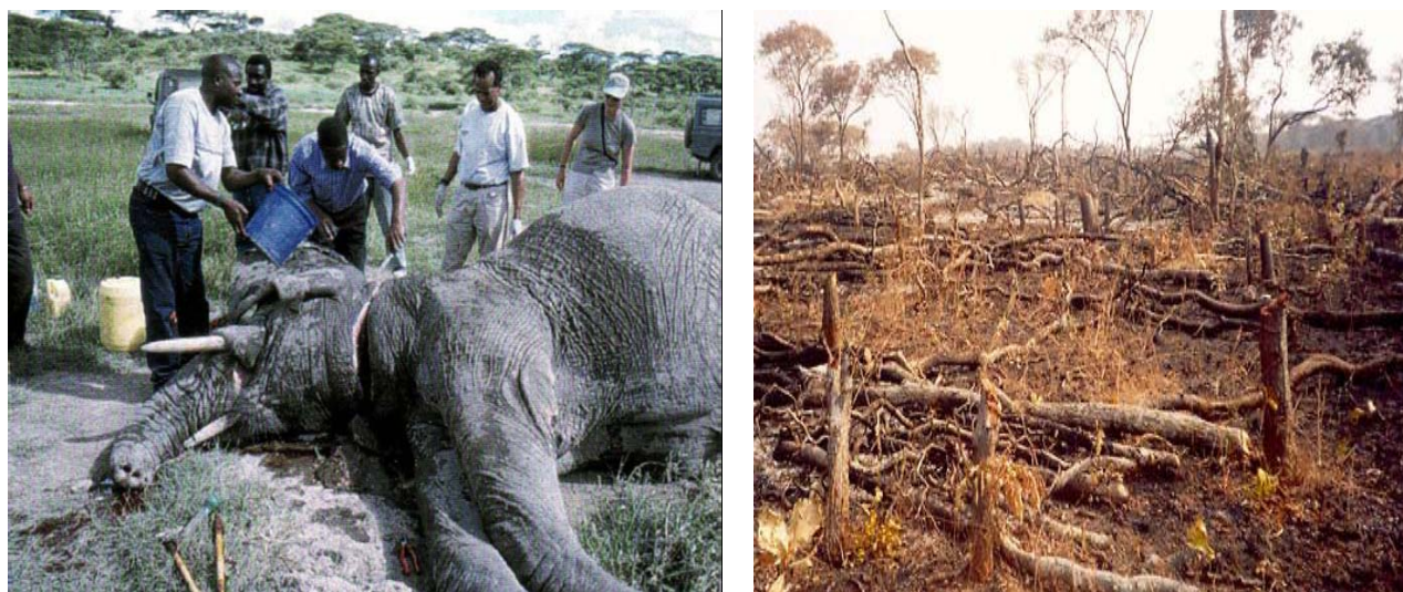
Fig 3: Human Factors in Serengeti: From Left: Effects of illegal hunting - wire snare around the neck of an elephant and Wildlife habitats destroyed for agricultural expansion,

(Kenyan part of the Serengeti ecosystem) between 1977 and 1997 and, consequently, reduction of the wildebeest population by 75%, was mainly caused by the high opportunity cost that landowners would incur by opting for wildlife conservation instead of pursuing mechanized agriculture. The latter was ecologically destructive but economically more attractive to farmers. Its profit was 15 times greater [43]. Furthermore, by virtue of being too minimal, conservation benefits do not contribute adequately to poverty reduction. People's direct dependence on natural resources has therefore remained inevitable.